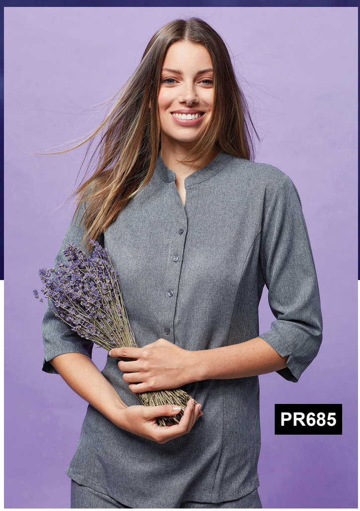
PR685 Verbena 'linen look' button-up beauty tunic