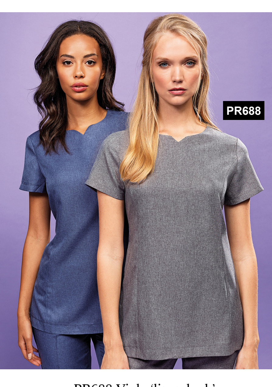
PR688 Viola 'linen look' cut neck beauty tunic